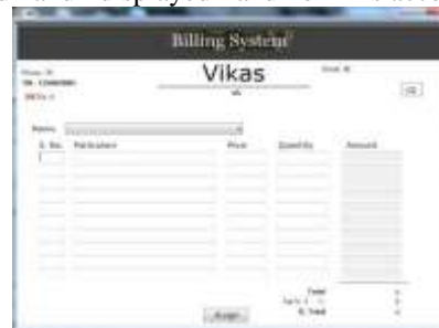
Fig (c) Entry creation

I. Create Entry: with a particular bill number which is automatically updated with each bill is created. In this the bill is created with the account holder's name. along with the serial numbers various particulars are added with their prices in separate text field with the quantity which are ordered. The amount is calculated accordingly. The grand total is calculated by applying tax rate. Taxes of various rates are available and are selected by the user automatically. Finally total amount is calculated and displayed and bill is accepted.