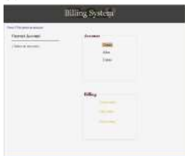
Fig (a) Main Window

I.Create: it will create a account for the user with the following details :-