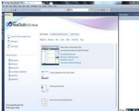
Fig (d)Visual Studio 2010

Visual studio: this software is used to develop the application Visual studio project templates: Visual Studio 2010 includes designers that we can use to create Web Parts, application pages, and user controls for a SharePoint site. By developing in Visual Studio, you get benefits such as full support for code debugging, Intellisense, and statement completion. Project wizards simplify solution development. In Visual Studio 2010 we can create workflows at the site level. In addition, we can add association and initiation forms for either list or site workflows.