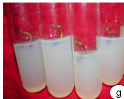
Fig 1g Shoots growing on regeneration medium

Only four shoots of LD 694 survived after third selection (Fig 1f). Similarly, for LH 2076, a total of 50 shoots were regenerated from shoot tips inoculated with Agrobacterium , out of which 37 shoots were transferred to selection medium supplemented with kanamycin and 10 shoots were cultured on half strength MS medium (Table 4). Fig 1g shows transformed regenerated shoots of LH 2076 growing on half strength MS medium without kanamycin. After first selection cycle of 30 days, 18 shoots out of 37 shoots of LH 2076 survived on medium containing kanamycin and remaining did not survive and got eliminated.