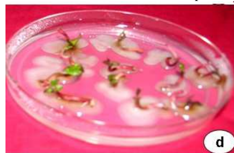
Fig 1d Spotted culture

In this experiment, excised shoot tips of LD 694 and LH 2076 from 5-day old seedlings were injured in apical meristematic region prior to infection with bacterium. The explants of both the varieties were inoculated with Agrobacterium strain GV3101 diluted to a concentration of 500 \mu l /25ml \frac{1}{2} MS by using dip and spot methods for a period of 10 min and co-cultivated for 48 and 72 hrs on \frac{1}{2} MS medium. The infected shoot tips were transferred to half strength MS + 250mg/l cefotaxime medium after co-cultivation on half strength MS medium. Data recorded on percent explant infection and survival based on inoculation method showed that spotted inoculation exhibited higher infection rate (83.92% and 85.41%) than dipping method (69.68% and 73.80%) in both LD 694 and LH 2076 varieties (Table 2). The over growth of Agrobacterium was observed on explants in spotted method whereas bacterial growth was restricted only to the explants in dipped method. The spotted explants had shown necrosis with excessive bacterial growth (Fig 1d) and it was difficult to control at later stages that led to poor survival of 41.45 and 47.62 per cent of infected explants in LD 694 and LH 2076 varieties, respectively.