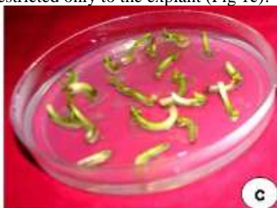
Fig 1c Growth of Agrobacterium after 3 days in dip culture

In other two experiments, bacterial broth was diluted using 500 and 100 \mu l in 25 ml of liquid \frac{1}{2} MS media and used for co-cultivation of shoot tips excised from 5-day old in vitro grown seedlings. In these experiments, excised shoot tips from both the varieties were gently injured in apical meristematic region and co-cultured with Agrobacterium strain GV3101 (plasmid pPZP200). It is believed that wounding the shoot tip allows Agrobacterium to efficiently infect deep within the meristematic tissue. Gould and Magallanes (1998) also bisected the shoot from apex to base and removed excess tissue from stem base before inoculation with Agrobacterium . Lateral section of cotton shoot was removed to expose meristem in the apical region so that Agrobacterium might infect the apical meristem. The infected shoot tips were transferred to half strength MS medium and two days after co-cultivation on half strength MS medium, no over growth of Agrobacterium was observed and bacterial growth was restricted only to the explant (Fig 1c).