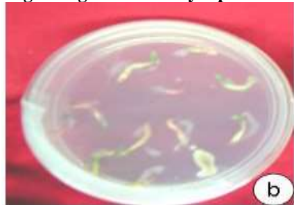
Fig 1b Spotted method

In other two experiments, bacterial broth was diluted using 500 and 100 \mu l in 25 ml of liquid \frac{1}{2} MS media and used for co-cultivation of shoot tips excised from 5-day old in vitro grown seedlings. In these experiments, excised shoot tips from both the varieties were gently injured in apical meristematic region and co-cultured with Agrobacterium strain GV3101 (plasmid pPZP200). It is believed that wounding the shoot tip allows Agrobacterium to efficiently infect deep within the meristematic tissue. Gould and Magallanes (1998) also bisected the shoot from apex to base and removed excess tissue from stem base before inoculation with Agrobacterium . Lateral section of cotton shoot was removed to expose meristem in the apical region so that Agrobacterium might infect the apical meristem. The infected shoot tips were transferred to half strength MS medium and two days after co-cultivation on half strength MS medium, no over growth of Agrobacterium was observed and bacterial growth was restricted only to the explant (Fig 1c).