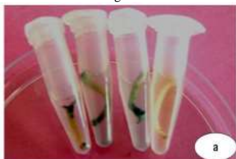
Fig 2a Shoot tips showing GUS expression (blue tips) along with control

Three days after co-cultivation the histochemical GUS assay was done that showed GUS expression in shoot tips varied from 5.55 to 12.50% (Table 5). The GUS expression in shoot tips and control are shown in Fig 2a.