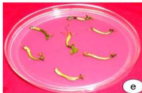
Fig 1e Shoot tips explants on selection medium containing cefotaxime (250mg/l) and Kanamycin 50 mg/l)

medium i.e. half strength MS supplemented with 50 mg/l kanamycin (Table 4). After 15 days on selection medium, leaves of 35 regenerated shoots started to turn pale and withered (Fig 1e), whereas, 5 shoots on half strength MS without kanamycin remained green. After first selection of 30 days, 19 shoots out of 35 shoots of LD 694 survived, remaining turned dark brown and got eliminated (Table 4).