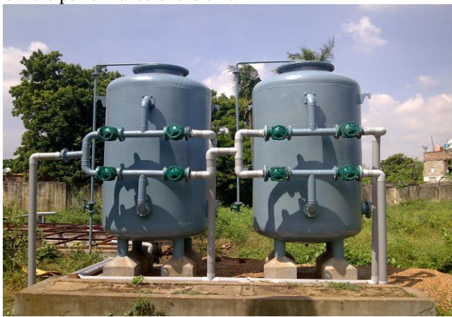
Fig 2 Renovated Sand Filter and Activated Carbon Filter

And then the effluent from the activated carbon filter is to be characterized by using various experimental procedures and compared with the quality of the feed. This will be useful to know the performance of the unit.