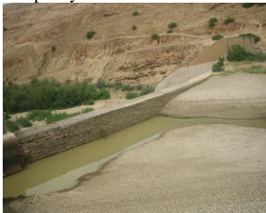
Fig.3. Barrage envasé à 100% dans le bassin versant de Chellif (Ouest Algérien)

For the only dam Beni Haroun, one considered the deposit annual of sediments at 9 million m^3 . For the moment, one estimates at 3,5 million m^3 of mud per year the rate of silting since its current capacity does not exceed 350 million m^3 .