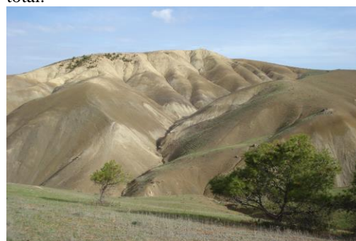
Fig.1. Un vue sur le bassin versant très dégradé du Beni Chougrane (Ouest Algérien)(Remini B., 2008)

There are currently 57 dams in exploitation (fig. 2) that, all to varying degrees, gradually silting up of 45 million m^3 /year, which represents an annual loss of capacity equal to 0.65% of capacity total.