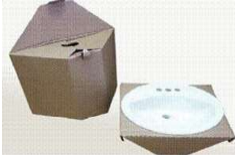
Figure 2 Washbasin packaging

Based on these goals, the total cost of ownership (TCO) model that initially was used by the foreign partner (IP) was adapted to company operations in Turkey. Two packaging cases representative of this methodology are presented here. In 2005, Olmuksa was the recipient of the "Golden Package" award from the Turkish Standards Institution (TSE) and the "World Star" awarded by the World Packaging Organization (WPO) for its packaging concepts [17, 18]. Olmuksa designed washbasin packaging for the Eczacıbaşı-Vitra group (Figure 2) [19].