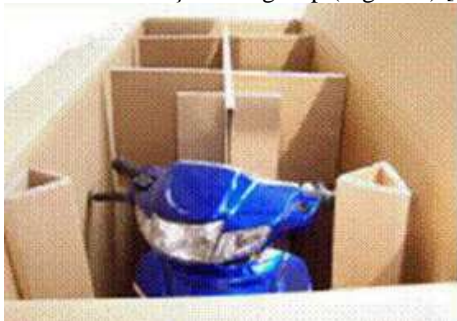
Figure 3 Motorcycle packaging

Based on these goals, the total cost of ownership (TCO) model that initially was used by the foreign partner (IP) was adapted to company operations in Turkey. Two packaging cases representative of this methodology are presented here. In 2005, Olmuksa was the recipient of the "Golden Package" award from the Turkish Standards Institution (TSE) and the "World Star" awarded by the World Packaging Organization (WPO) for its packaging concepts [17, 18]. Olmuksa designed washbasin packaging for the Eczacıbaşı-Vitra group (Figure 2) [19].