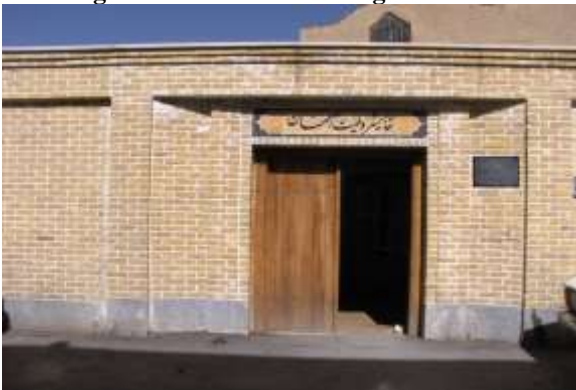
Figure 2: The exterior design of houses