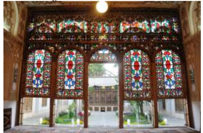
Figure 5: Different doors and corridors