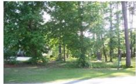
Figure.4 Atmospheric blur image

where variance \sigma_G determines the severity of the blur, and constant C is chosen so that the sum of the coefficients is equal to one (Lagendijk&Biemond 2005). Figure illustrates a discrete atmospheric turbulence blur PSF h(n) corresponding to \sigma_G = 9/4 and Figure shows the corresponding magnitude response |H(u)| . In the continuous case, the magnitude response would be a pure 2-D Gaussian, but in the discrete case, it contains some oscillation due to the finite support of the PSF. Figure illustrates an image which is Gaussian blurred using the PSF in Figure. Figure shows an arbitrary blur PSF, the magnitude response being shown in Figure. The corresponding blurred image is illustrated in Figure. The existing blur invariant image features are based on the assumption that the PSF of the blur is spatially invariant and centrally symmetric with respect to the origin. These conditions are met by the above mentioned forms of motion, out of focus, and atmospheric turbulence blur PSFs.