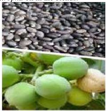
Figure 1: Jatropha fruits and seeds

Different properties of Jatropha oil were experimentally determined and compared with theoretical equations developed in the study. The study suggested that Jatropha oil can be used as a source of triglycerides in manufacture of biodiesel cost-effectively. Jatropha oil in a diesel engine is investigated [3, 4]. Acceptable thermal efficiencies of the engine were obtained with blends up to J50. The performance of Jatropha oil blends in a diesel engine is examined. The most significant conclusion from the study was that the J2.6 produced maximum values of brake power and brake thermal efficiency as well as minimum values of specific fuel consumption. It indicates that the successful use of Jatropha oil is a function of engine type, and percentage of Jatropha oil in the blends.