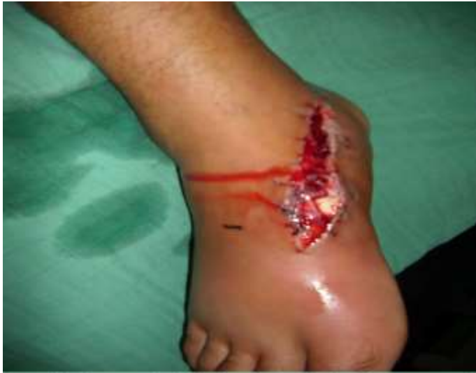
figure1:clinical appearance of medial cuneiform fracture-dislocation with cutaneous wound

sometimes associated with this type of injury. Un one case of nonunion has been reported by Loud et al (13) and treated with open reduction and internal fixation. No complications were seen in this case.