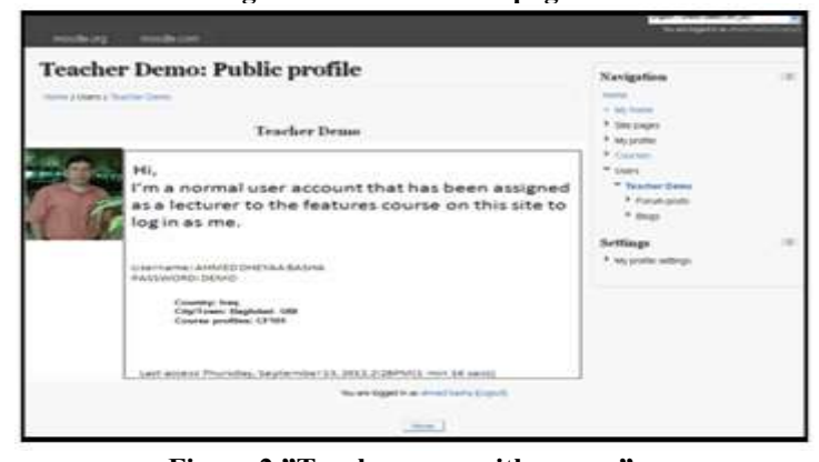
Figure 2."Teacher page with course"

The communication tools included discussion forums, email, calendar announcements, chat forum, and a whiteboard. During the course, all participants from students were introduced to a new lecture per week. Moreover they had to read assigned topic dealing with that lecture and discuss it later with their peers and instructor in designing discussion forum. Meanwhile