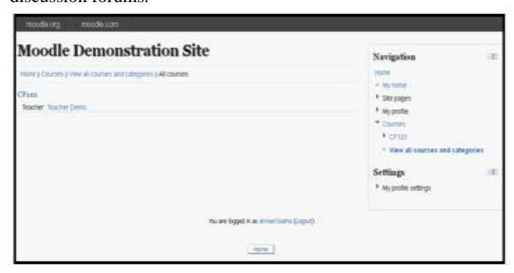
Figure1. "Course main page"