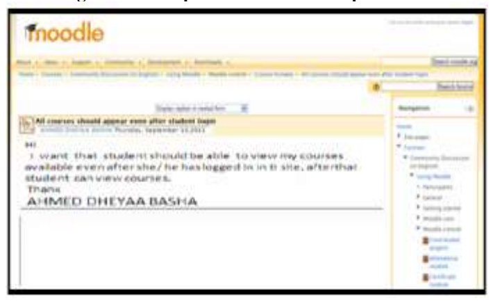
Figure 4."Compose of the discussion forums in online course"

Meanwhile, private tasks were assigned to groups of students and extra discussion forums were indicated for each group. Occasionally, students used e-mail for their questions with the instructor and their colleagues. They used chat forums and white boards less frequently. The course evaluation consisted of exams (in classroom), studies, and participation in discussion forums.