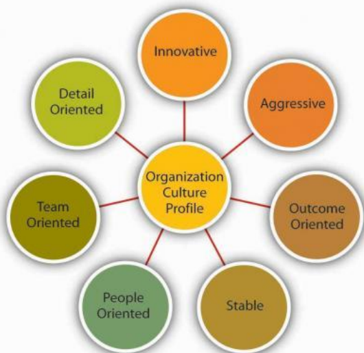
Figure 1. Dimensions of Organizational Culture Profile (OCP)

Which values characterize an organization's culture? Even though culture may not be immediately observable, identifying a set of values that might be used to describe an organization's culture helps us identify, measure, and manage culture more effectively. For this purpose, several researchers have proposed various culture typologies. One typology that has received a lot of research attention is the Organizational Culture Profile (OCP) where culture is represented by seven distinct values.