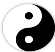
Fig 1. Ying and Yang

It is the Chinese philosophy: Yin and Yang (or Femininity and Masculinity) as contraries: