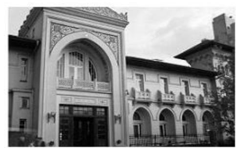
Fig. 3. Palace Hotel, Ankara, Vedat Tek & Kemaleddin Bey, 1928