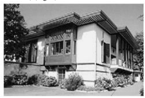
Fig. 6. Governor's house in Mudanya, Bursa. Orhan Arda and Emin Onat (Batur, 2005: 38)

The second movement also turned to the monumental and academic nationalism, based on Holzmeister and Bonatz theories. The buildings were constructed according to the Western modern architecture principles as well as techniques and materials, whereas the buildings' national characteristics appeared through the components like windows, capitals ... (Holod et al. 1984) (Fig. 5).