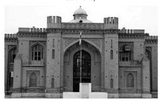
Fig. 8. The American Collage of Tehran, Tehran, Leo Markov, 1929