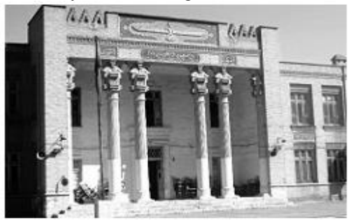
Figure 9. Anushirvan School, Tehran, Nikolai Markov, 1937