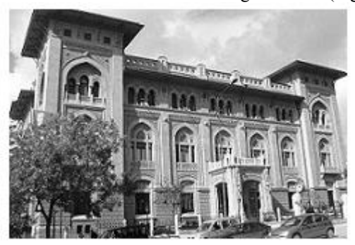
Fig. 2. Ziraat Bank Headquarters, Ankara, Giulio Mongeri, 1929 (www.wikipedia.org/Ziraat Bankası)

The Republic of Turkey planed to seek his release from the Ottoman image and to create a kind of nationalism combined with the republican ideals. The development of Ankara to a modern city seriously challenged the profession of architecture. In order to solve the challenge, the republican leaders turned to the architects who later were called as the founders of the First National Architecture Movement. Although, Ilhan Tekeli noted: "Even there is no certainty whether there was any special attention to the promotion and encouragement of such an architectural style or not; maybe the owners of these buildings' demands who were the foreign companies' managers, hoping to gain greater social acceptance, turned to this architectural style." (Holod et al., 1984) Almost all buildings built in this period followed the Ottoman architecture's design features (Fig. 2, 3).