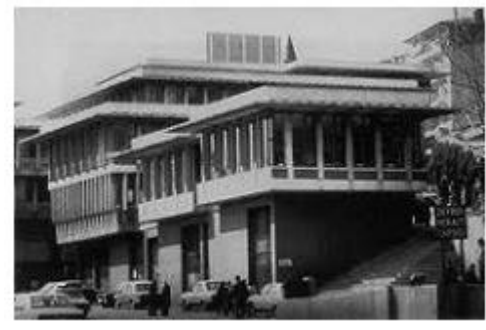
Fig. 4. Taşlık Oriental Coffeehouse, Istanbul, Eldem, 1948 (Bozdoğan et al., 1987)

It is noteworthy that there were the fundamental differences as well as similarities between the first and second National Architecture Movements in Turkey which the specific features of the second movement shall be appointed as follow according to Afife Batur (2005).