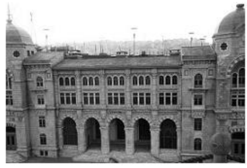
Fig. 1. Central Post Office, Istanbul, Vedat Tek, 1909

- Transition Period: 1923-1928 - The Years of War: 1938-1950