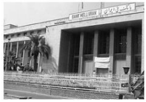
Fig. 7. Bank Melli Iran, Tehran. Mohsen Forughi, 1942

decisively attempted to define a new Identity for the contemporary architecture of Iran, applying the post-Islamic architectural patterns, and even combining the pre-Islamic and post-Islamic features (Fig. 8).