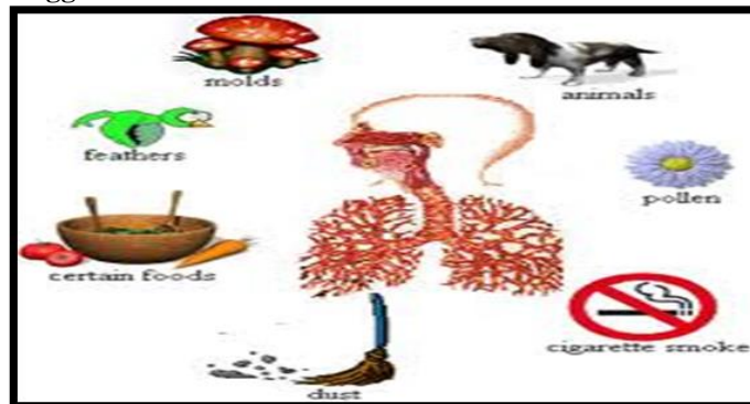
Fig (2): Some Triggers of Asthma Attack (4).

The lung is susceptible to oxidative injury by virtue of myriads of reactive forms of oxygen species and free radicals. The generation of reactive oxygen species in the lungs is enhanced after exposure to numerous exogenous chemical and physical agents, which include mineral dusts, ozone, nitrogen oxides, ultraviolet and ionizing radiation and tobacco smoke. Oxidant stress can lead to peroxidation of membrane lipids, depletion of nicotinamide nucleotides, rises in intracellular calcium ions, cytoskeleton disruption and DNA damage (14).