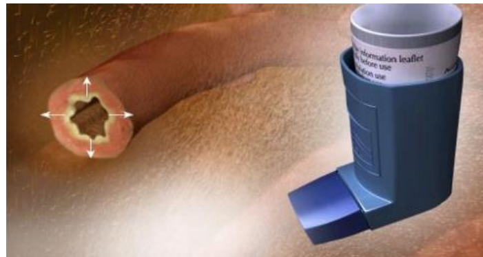
Fig (4): Bronchodilators (36)

Bronchodilators promptly reverse airway obstruction in asthmatics. This action believed to be mediated by a direct effect on airway smooth muscle. However, additional pharmacologic effects on the other airway cells (such as capillary endothelium to reduce microvascular leakage and mast cells to reduce release of bronchoconstrictor mediators) may contribute to the overall reduction in airway narrowing. Only three types of bronchodilators are in current clinical use: \beta -adrenergic agonists, methylxanthines, and anticholinergics (23).