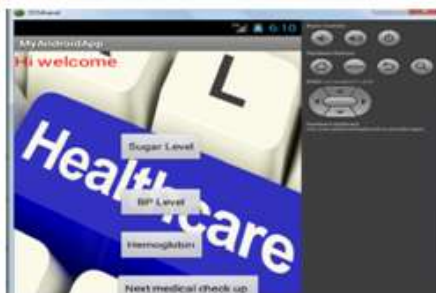
Fig. 4 Health monitoring activity of android application working in an Android emulator

The measured biomedical signals are sent to the server PC through the internet by using the M2M gateway for further processing. The monitoring and analysis program, written in the C# programming language, monitors, stores, and processes the received data in the server PC[19]. Once a data packet has been received through the M2M devices, the packet is processed, and useful data is extracted. When the data is received, an IPv6 address is identified first to ensure that the aggregated data has been sent from the correct M2M device source. Then, the received data is scanned to ensure the data packet is a complete packet. This program continuously monitors not only biomedical signals, such as the PPG signals and oxygen saturation data acquired by wearable sensors, but also information related to M2M devices[19], such as communication settings and IPv6 addresses, in real-time. Further, it sends the received data to the Android mobile device to support the mobile healthcare monitoring system wirelessly after emulator testing. The mobile monitoring program was implemented and tested on the Android mobile device (Samsung Galaxy S,Korea) [21] running a 1 GHz ARM processor (Cortex A8,Hummingbird) and Android OS version 2.3.6. Through the wired or wireless internet, the server is able to connect to different types of mobile devices and various development testing can be performed on it.