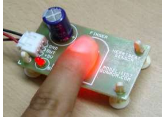
Fig 2. Heart Beat sensor

translation to either 16-bit short addresses or IEEE EUI64-bit extended addresses [19].