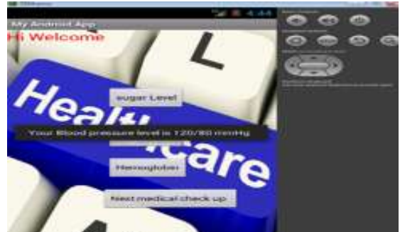
Fig. 5 Display of BP Level in Emulator

Figure 5 shows the Blood Pressure display of patient level. By pressing the button of each level, it shows the health condition of patient.