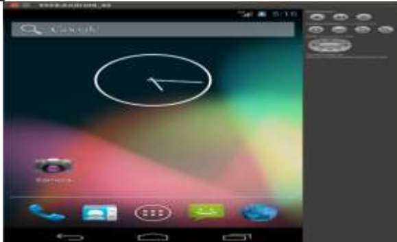
Fig. 3 Emulator Display

that have only one window visible at a time. Hyper Next Android Creator's main programming language is simply called Hyper Next and is loosely based on Hyper card's Hyper Talk language. Hyper Next is an interpreted English-like language and has many features that allow creation of Android applications. It supports a growing subset of the Android SDK including its own versions of the GUI control types and automatically runs its own background service so apps can continue to run and process information while in the background.