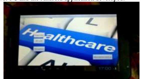
Fig. 6 Monitoring health condition in android

For the remote health monitoring of the patient, An application program has been developed. In that application media contents also included. The Android application is also implemented on a Tablet PC. It works properly in the phone. The future works to done are communication of sensors with the M2M node and data transmission of sensors through M2M node to server PC and the Android application developed.