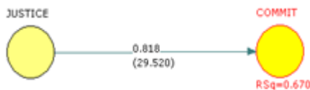
Figure 2. Conceptual model of the research Secondary hypotheses

Affective commitment (AC):(0.65*Q1)+ (0.65*Q2)+ (0.66*Q3) Continuance commitment(CC): (0.76*Q4)+ (0.61*Q5)+ (0.67*Q6) normative commitment(NC): (0.72*Q7)+ (0.73*Q8)+ (0.74*Q9) + (0.70*Q10) distributinal justice(DJ): (0.64 *Q11)+ (0.69 *Q12)+ (0.73 *Q13) procedural justice(PJ): (0.73*Q14)+ (0.73*Q15)+ (0.80*Q16) + (0.80*Q17)+ (0.65*Q18) interactional justice(IJ): (0.71*Q19)+ (0.73*Q20)+ (0.72*Q21)