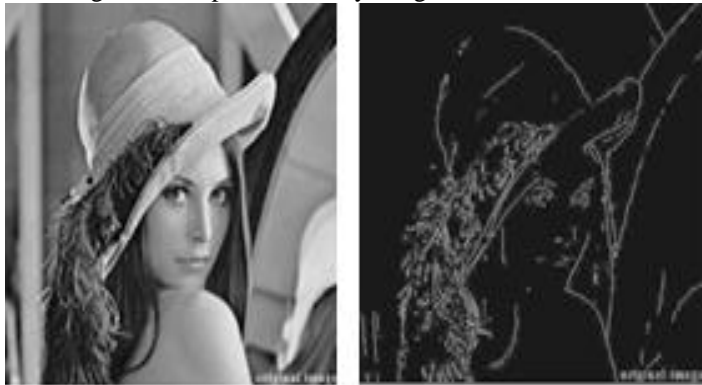
a) Original Image & b) Output Image

Edge detection methods [1] [2] locate the pixels in the image that correspond to the edges of the objects seen in the image. The result is a binary image with the detected edge pixels. Common algorithms used are Sobel, Prewitt and Laplacian operators. These algorithms are suitable for images that are simple and noise-free; and will often produce missing edges, or extra edges on complex and noisy images.