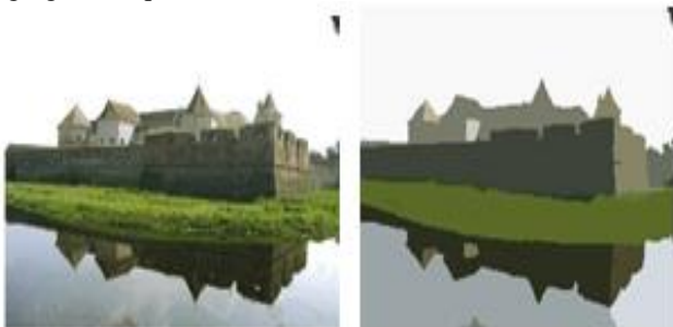
a) Original Image & b) Segmented Image

The goal of region-based [1] [3] [7] [8] [9] segmentation is to use image characteristics to map individual pixels in an input image to sets of pixels called regions that might correspond to an object or a meaningful part of one. The various techniques are: Local techniques, Global techniques and Splitting and merging techniques.