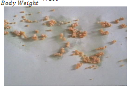
Plate 2. Eggs of Labeo senegalensis from the White Volta, Yapei, Ghana