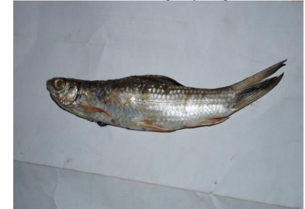
Plate 1. Labeo senegalensis from the White Volta, Yapei, Ghana

A total number of 150 Labeo senegalensis (plate 1) were collected from the landing site of the Yapei stretch from January to March 2013. The fish were caught by the gill net.