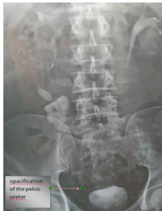
Figure 4 . Urography postoperative control

UIV showed improvement of split renal function without urinary obstruction (figure 4) so we found that ileoureteral anastomosis can be done successfully with no worry about organic or functional obstruction in carefully selected cases.