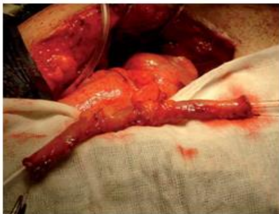
Figure 3 . Tubularization of the incised ileal segments

During follow-up, no complaint of excess mucus production was observed which was also noticed by other authors that used the same procedure (7). This observation is considered an advantage of this modification and most probably due to the marked reduction in the size of the secreting surface area in comparison to simple ileal ureter that may be associated with mucous obstruction in some cases (12). Moreover, hyperchloremic metabolic acidosis did not occur in our case, however it was reported by various studies using simple ileal ureter in varying percentages (8,9). Absence of metabolic disorders among our case can be explained by proper selection of patient (serum creatinine = 12 mg/l) and reduction of the size of absorbing surface area.