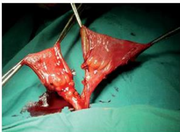
Figure 2 . Isolation of 2 ileal segments on their mesenteric pedicle