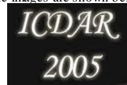
Figure 2: Original Image

The performance of the proposed system is evaluated in this section. We first extract the lower and higher coefficients from the input text image. Then detect the edges for the all coefficients, in that edge detect image applying the morphological dilation image, this is for text localization. Then extract the text for applying the Logical AND operation and superimpose with the original image. Finally we get the text extracted image. The images are shown below