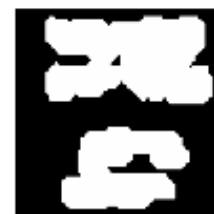
Figure 3. Image after text localization