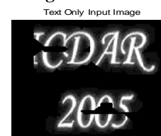
Figure 4. Image with text only using proposed method Comparison with the existing methods