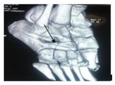
Figure 3. CT reconstruction image showing the ankle bone fusion between the two bones of the tarsus: the calcaneus and the navicular bone.