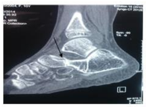
Figure 2. Sagittal scan slice confirming calcaneo navicular coalition.