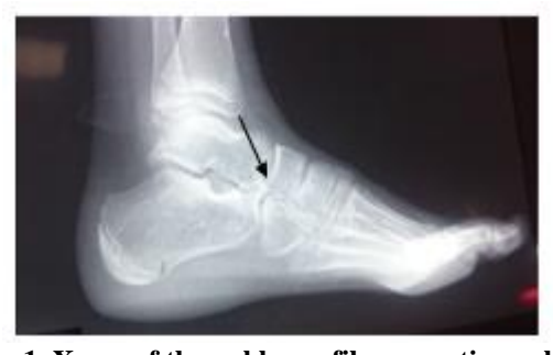
Figure 1. X-ray of the ankle profile suspecting calcaneo navicular coalition.

The radiological study of the foot, on the impact of front, side and oblic three quarters, suggesting the possibility of tarsal coalition (Fig. 1). The additional study by scanner of the ankle showed the existence of a calcaneo navicular coalition (Fig. 2 and Fig. 3).