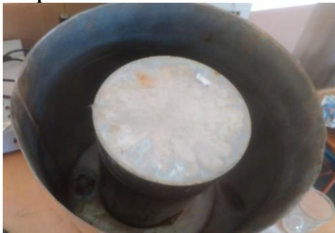
Figure 9. Jacket of bomb calorimeter filled with glass wool.

Average temperature difference is 2.43 °C