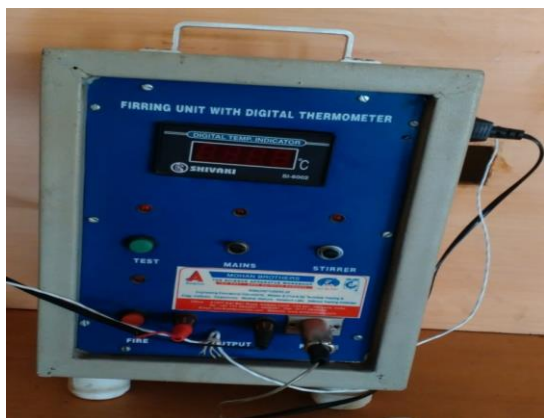
Figure 7. Controller unit