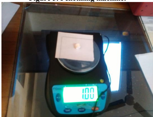
Figure 4. Benzoic acid is being weighed in digital weighing machine.

Temperature sensor is then inserted in the bucket water such that there is adequate space between stirrer, thermometer, bomb and lead wires. Now the apparatus is fully assembled and prepared for experiment.