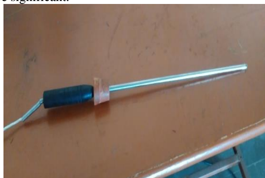
Figure 6. Temperature sensing device

Bomb calorimetry provides desired data in a very direct way that's why it is used widely in chemistry; it is still used in the fuel and food industries. In the field of food industries its results are sometime criticized because our body does not convert the food into the same products as those formed by combustion in a calorimeter. Other, more subtle, factors may also be significant.