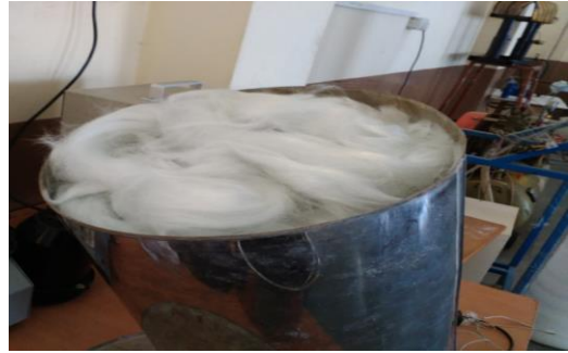
Figure 10. Jacket of bomb calorimeter filled with glass wool

Average temperature difference is 2.3 °C