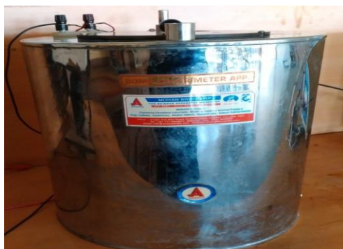
Figure 2. Outer shell of bomb calorimeter jacket.

Fuel sample has been palletized with the help of pallet and then small measured mass of it is taken in the crucible (about 1 gm). The crucible is kept in the crucible holder of the bomb such that the fuse wires passes through the fuel. The lid of the bomb then fastened manually. After that with the oxygen intake valve not more than 2 Mpa of oxygen is supplied to the bomb. Some amount of oxygen is purged through the bomb to remove the air already present and then the oxygen supply is cut off. Oxygen pressure also helps in sealing of the bomb. Then fill the bucket with water (approximately 2000 ml) and check the water temperature. Then weighed the bucket plus water. After that prepared bomb is then placed on tripod in the water filled bucket which insures its minimum contact with the bucket. The bucket with water is then placed over a tripod at the calorimeter jacket base. Lid of the calorimeter is kept in place with stirrer and temperature sensing device which were also adjusted with the calorimeter lid. The jacket is kept empty for now. All the required electrical connections are made. Lead wires connect the fuse wire inside bomb with the controller. Stirrer is placed in the bucket water for maintaining throughout even water temperature.