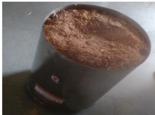
Figure 11. Jacket of bomb calorimeter filled with saw dust.