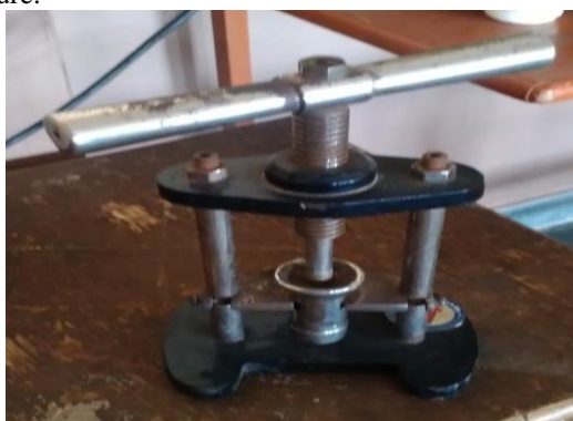
Figure 3. Pelletizing machine.

Fuel sample has been palletized with the help of pallet and then small measured mass of it is taken in the crucible (about 1 gm). The crucible is kept in the crucible holder of the bomb such that the fuse wires passes through the fuel. The lid of the bomb then fastened manually. After that with the oxygen intake valve not more than 2 Mpa of oxygen is supplied to the bomb. Some amount of oxygen is purged through the bomb to remove the air already present and then the oxygen supply is cut off. Oxygen pressure also helps in sealing of the bomb. Then fill the bucket with water (approximately 2000 ml) and check the water temperature. Then weighed the bucket plus water. After that prepared bomb is then placed on tripod in the water filled bucket which insures its minimum contact with the bucket. The bucket with water is then placed over a tripod at the calorimeter jacket base. Lid of the calorimeter is kept in place with stirrer and temperature sensing device which were also adjusted with the calorimeter lid. The jacket is kept empty for now. All the required electrical connections are made. Lead wires connect the fuse wire inside bomb with the controller. Stirrer is placed in the bucket water for maintaining throughout even water temperature.