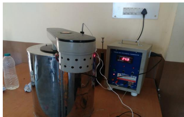
Figure 8. Assembly of bomb calorimeter.