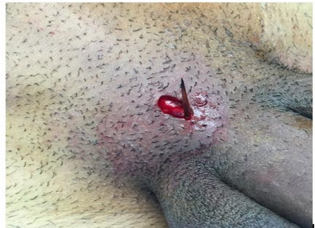
Figure 2. Removal of the foreign body by a mini-incision at the pubic symphysis.

The patient underwent a mini incision at the root of the penis after local anesthesia that allowed the removal of the foreign body.