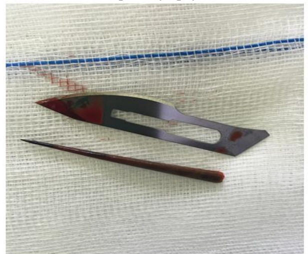
Figure 3. Exposure of the foreign body after extraction.