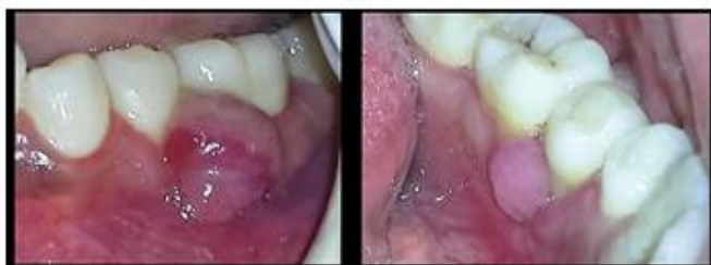
Figure 5. Significant regrowth of the granuloma after 6 months.

After reviewing the case, a decision was made to perform surgical excision combined with open flap debridement (OFD). The growth was excised employing scalpel and electrocautery and flaps with sulcular incisions was reflected buccally and lingually. Granulomatous tissue was curetted and the root surfaces were thoroughly planed. Simple interrupted sutures were placed and the patient was prescribed antibiotics and analgesics. No subsequent recurrence was noted for a post-operative period of three months (Figure 6).