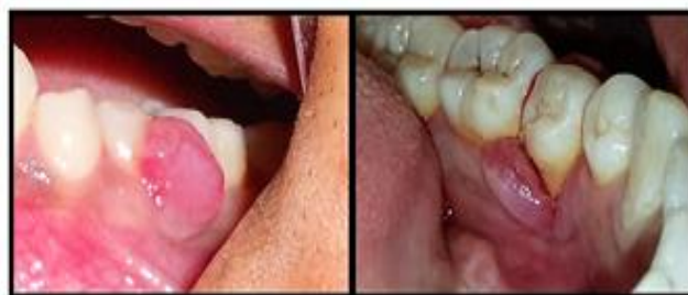
Figure 1. Intra-oral buccal and lingual views of the growth in relation to interdental region of mandibular second premolar and first molar.

Radiological examination revealed flattening of the interdental alveolar bone, indicating mild bone loss (Figure 2). Based on the observed clinical findings a provisional diagnosis of pyogenic granuloma was given.