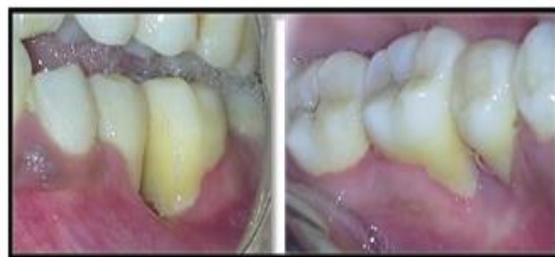
Figure 6. Post-op view several months after flap surgery showing no signs of recurrence.

Recurrence of PG may occur due to several causes such as incomplete excision leaving behind residual tissue resulting in regrowth, failure to detect and completely remove causative agents such as calculus or post-excision trauma of the area [9,10]. Some dermal cases of PG may occur as multiple satellite lesions mainly on torso and manifest as painless, reddish, intact papules.