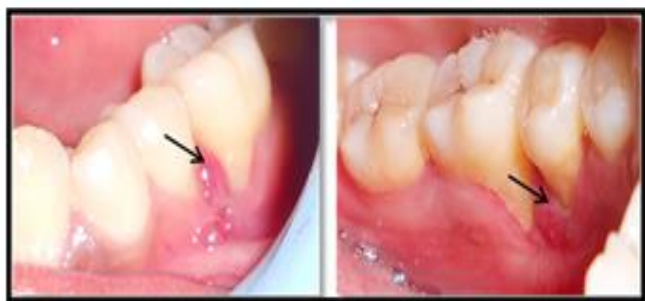
Figure 4. Mild recurrence of the lesion (black arrows) at the 1-month post-operative visit.