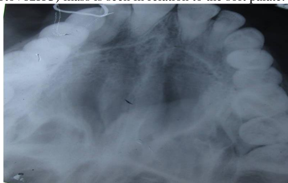
Fig 2. Occlusal Radiograph.

Occlusal radiograph revealed no bony erosion of the palate. (Fig 2) Plain CT PNS & PALATE report showed both maxillary sinuses are clear and patent ostia, bony wall intact. No mass lesion observed. Sphenoid ethmoid sinuses clear. No breach in Cribiformplate. Nasal Bones intact. Nasal Septum intact and deviated to right side. No mass lesion seen in nasal cavity and nasopharyngeal region. Inferior Nasal turbinates revealed mucosal hypertrophy. Hiatus Semilunaris compromised on both sides. Uncinate processes are normal. Lobulated irregular soft tissue attenuation value (+51to+62HU) mass is seen in relation to the soft palate.