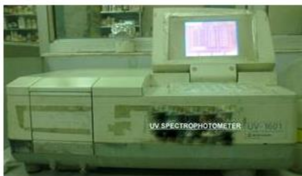
Figure (4) uv\vis device

Molecules containing \pi -electrons or non-bonding electrons (n-electrons) can absorb the energy in the form of ultraviolet or visible light to excite these electrons to higher anti-bonding molecular orbital's. The more easily excited the electrons (i.e. lower energy gap between the HOMO and the LUMO), the longer the wavelength of light it can absorb.