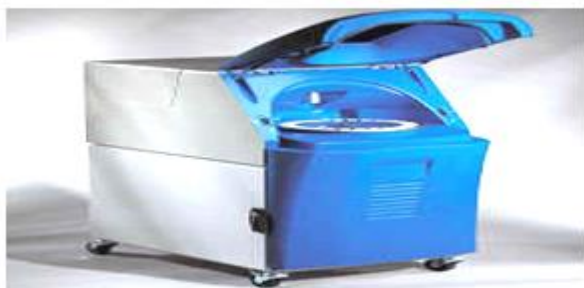
Figure 3. LIBS instrument for pharmaceutical industry.