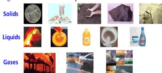
Figure 2. LIBS can analyze and identify samples in solid, liquid, and gas forms.

LIBS are an emerging technique for elemental composition analysis. It can analyze and identify solid, liquid, and gas samples with little-to-low sample preparation. Figure 2 shows some examples.