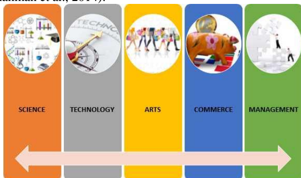
Figure 1. Textile and apparel education amalgamation of Science, Technology, Arts, Commerce and Management. Student-teacher involvement and contributions

We cannot ignore the fact that scientific information is widely available to public access through the digital media. However, it is important that technical concepts and theories are understood by students seeking Textile, Apparel and Fashion Education. A student may find difficulties in comprehending certain ideas and this may lead to inability in interpreting the content. In this context a gap is created between the student and the science content. This can turn into a loss of interest in scientific topics and disciplines, diminishing interactions between the student and the educator and less interest in comprehension of course content. In order to avoid this loss of enthusiasm in students, teacher involvement, training and up gradation of teaching skills is essential.