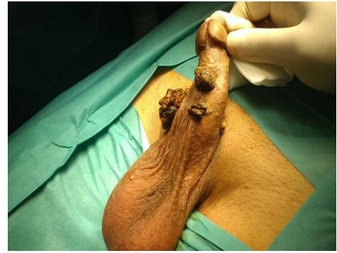
Figure 2: Buschke-Lowenstein tumor: kerato- verrucous cauliflower lesions on the ventral surface of the penis.

Treatment consisted of surgical excision with skin covering adjacent to the skin. The histological examination of the excision piece revealed an important papillomatous hyperplasia of the epidermis and some koilocytes in favor of a giant condyloma. After 2 years of retreat, we did not find any recurrence.