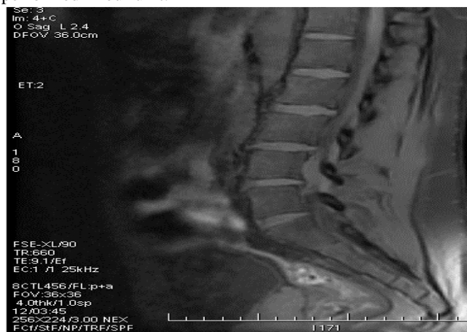
Figure1. T1-weighted MRI showing hypointense fragmented disc at L4–L5 level with a rupture of posterior annulus fibrosus.