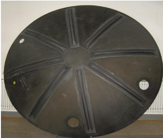
Figure 3. Rear pressure bulkhead of C919 [11].

stiffness and buckling properties of the section. The manufacturing of this archetype was finished approximately in 5 months after the Computer Aided Designment files were released, and the fast delivery of a state of art ROHACELL shape from Evonik ensured its realization. The succeeded roll-out of the rear pressure bulkhead archetype in October has further certificated the engineering designment and outpution processing; it also guarantees the plane development processing of other composite sections on the airliner [11].