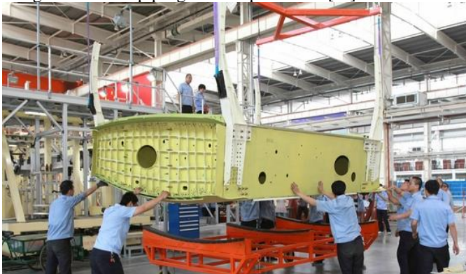
Figure 4. Main wing box of C919 [15].

The centre wing box is the most important psection of the main wing. So far this section was made of metal alloys like Al and Ti alloys. On Avic's Shenyang plant has consummated a composite aft-pressure bulkhead test. The body structure of the airliner will be made of an aluminium alloy. The centre wing box will be made from CFC [13]. The main wing box (Fig. 4) was originally intended to use of CFC, but the designment was changed to an Al-materials designment to drop program complications [15].