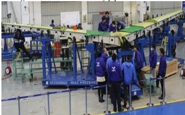
Figure 2. Horizontal stabilizer of C919 [9].

Fibrous-hardened polymer composite materials with high mechanical force and fatigue resistance, light heaviness, and perfect elevated temperature features are the combin of several polymer matrix and fibrouss. Hence finest mechanical properties of fiber composites, they are the up-and-coming solutions to the different mercantile execution, particularly in the weight-critical airliner industry [4].