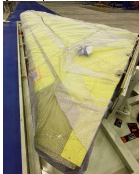
Figure 5. The vertical tail section of the initial C919 airliner [22].

The main wing box was originally intended to use CFC [19]. It was changed later to an Al material designment to drop designment complications [20].