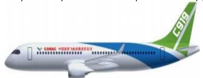
Figure 1. The C919 [3].

Currently, composite materials represent 50 % of the weight for Boeing 787s and 52 % for Airbus 350XWB airliners. More fibrous reinforced composites are being applied in their airliner structures like by the two giant aerospace companies. China's aerospace industry has developed at an impressive rate over the past two decades [4].