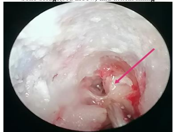
Figure 2. The head of the malleus may be fixed to the bony walls of the epitympanic recess (red arrow)